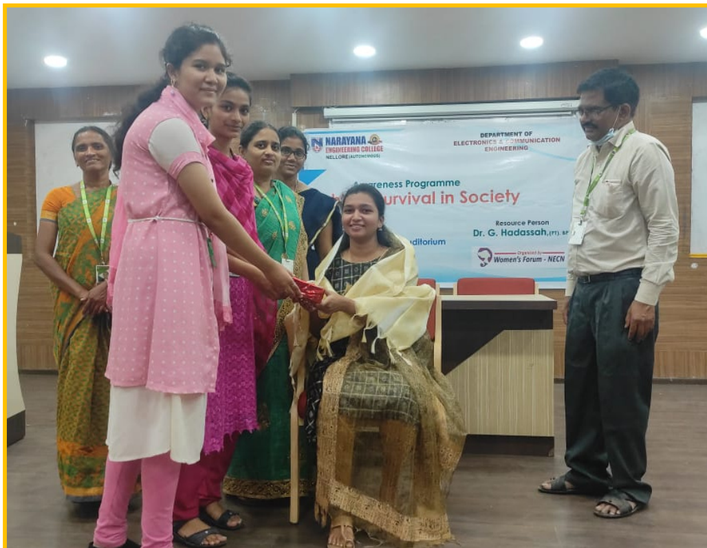
Felicitating the resource person