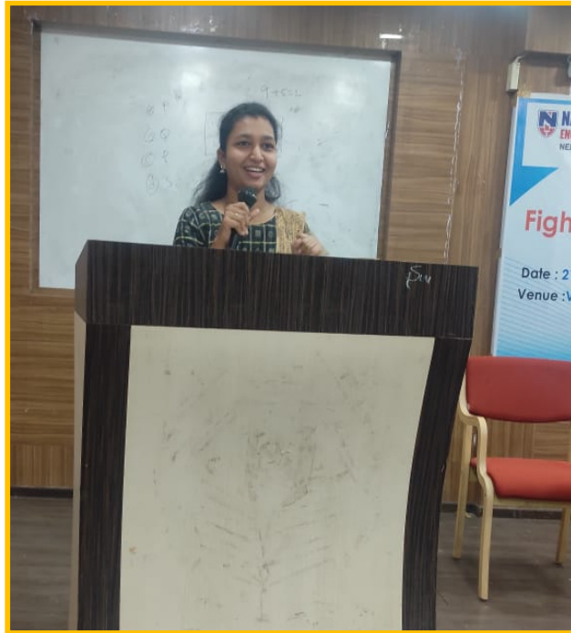
Resource person addressing the gathering with a valuable speech